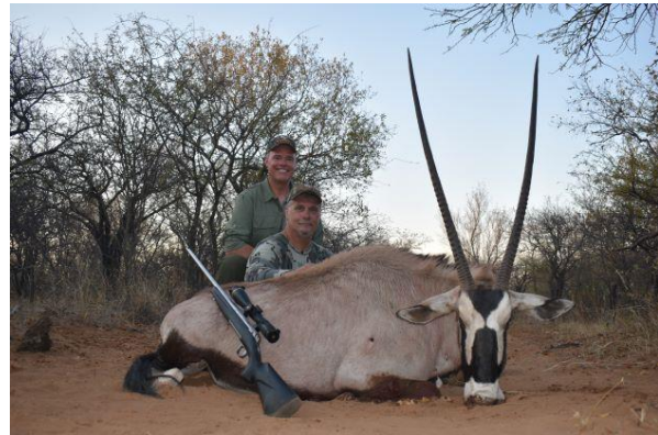
Mark's 40" Gemsbuck