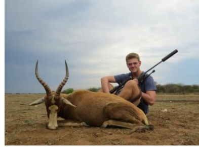
The De Youngs having a blast