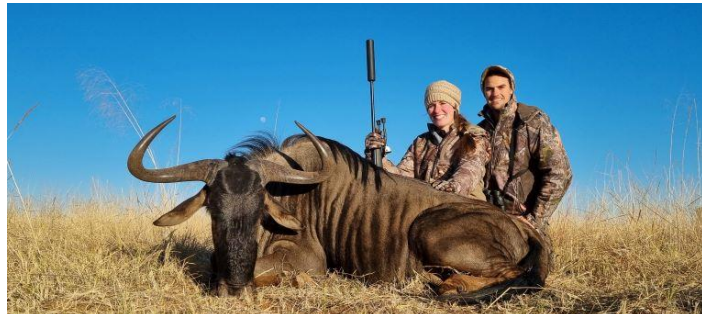
Breanna's Blue Wildebeest