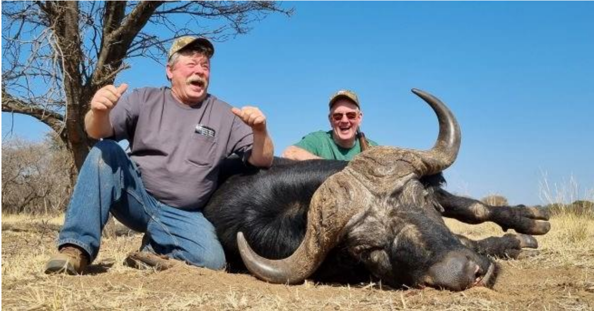
A picture can speak more than a 1000 words.

hunting thing was the best time ever, so he booked his 2023 buffalo hunt right there. The 10 days went by like the blink of an eye, with wonderful memories between some good friends. We are all looking very much forward to the 2023 hunt.